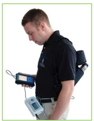
FM-801 (on optional ACC-BELTCL-I belt clip) shown connected to GrayWolf AdvancedSense™