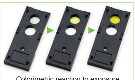
Colorimetric reaction to exposure

Sensor element employs the chemical reaction between formaldehyde and \beta -diketone impregnated in a porous glass. The concentration of rutidine derivatives yellows the sensor in proportion to the formaldehyde concentration and the duration of exposure. The difference of absorbance between samples is measured by radiating a constant wavelength light (absorptiometric method) and then an algorithm converts to ppb or \mu g/m3 HCHO.