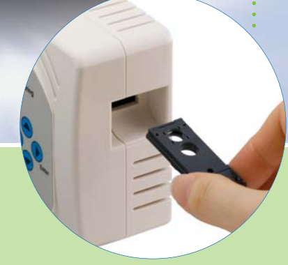
Detachable Sensor Cartridge